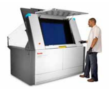
Kodak Trendsetter 800 Platesetter with Autoloader

The robustness and advanced imaging technology of the Trendsetter 800 Platesetter have made it a popular choice with printers throughout the world.